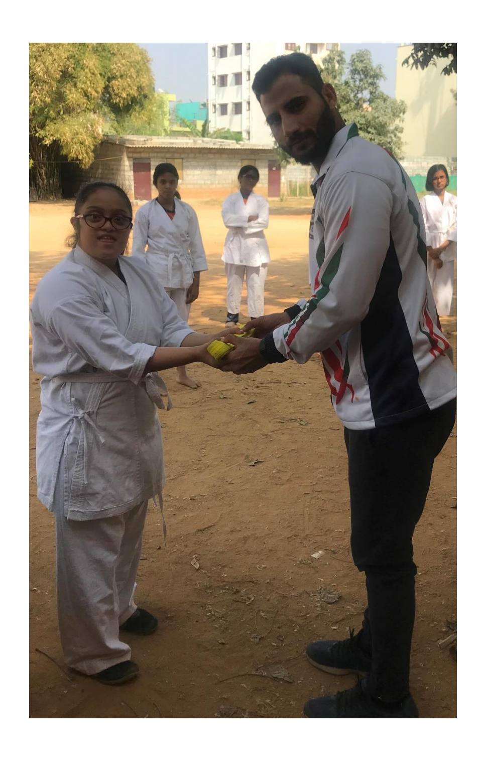
No one can limit me, I am strong too !!!