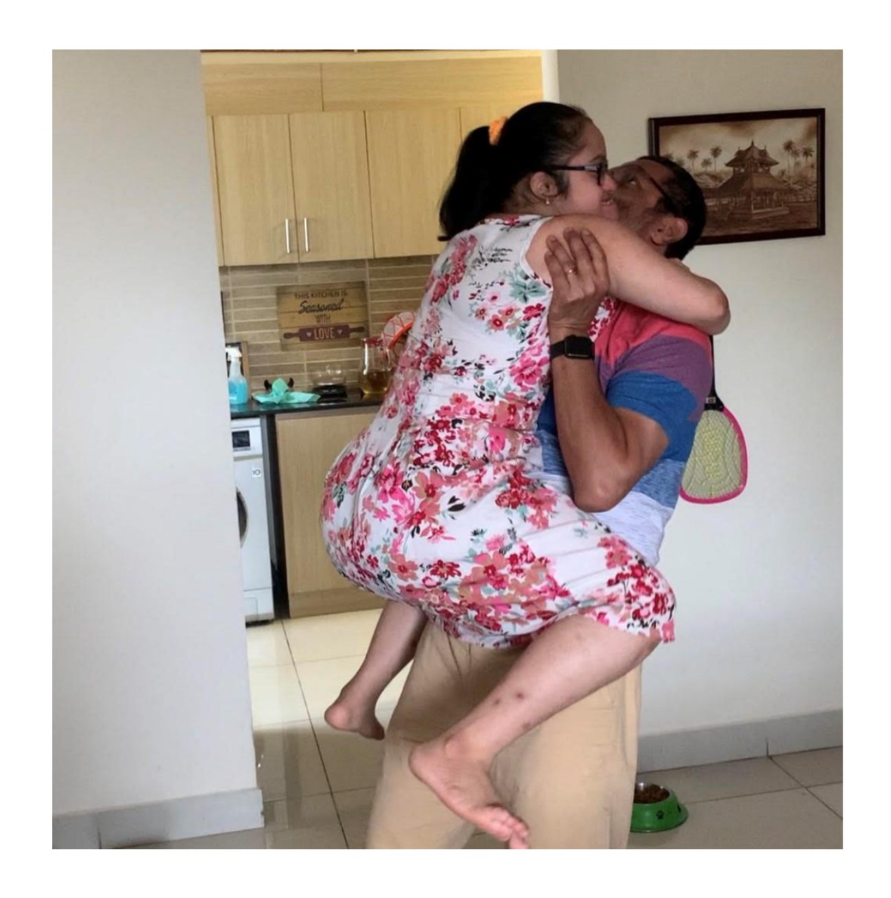
Who says Academics is not my cup of tea.. This is how my dad lifted me when I cleared my Grade 10 exam !!