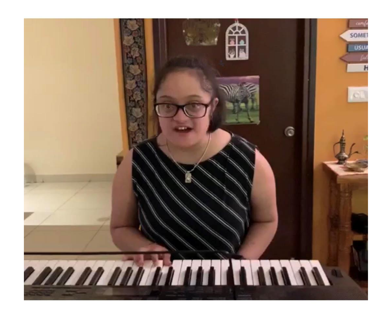
Nothing is IMPOSSIBLE !!! With practice, I can master fine motor skills too.