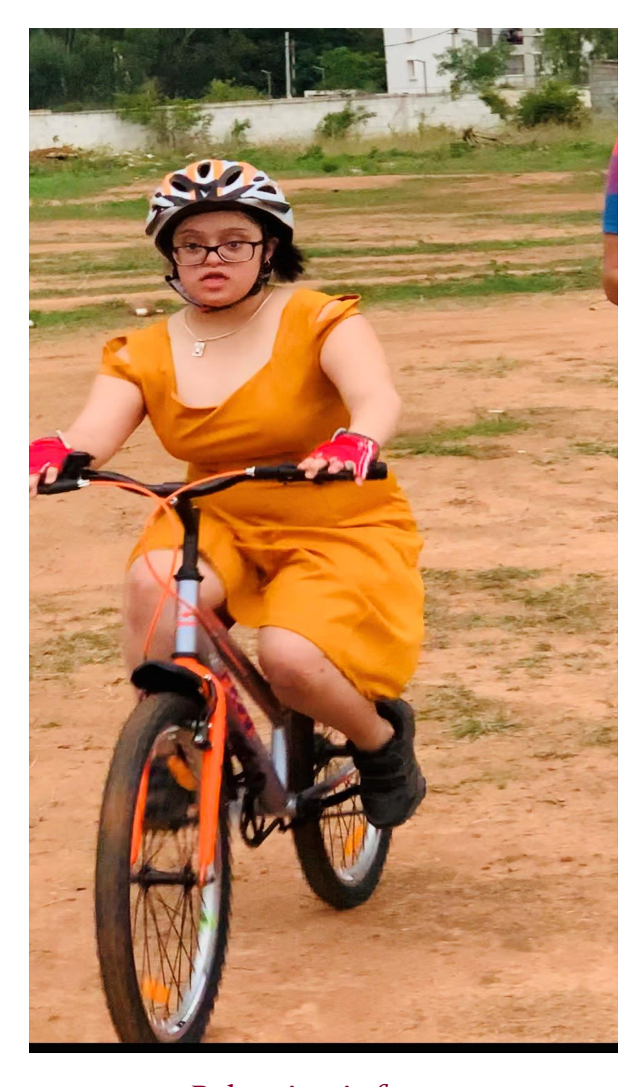
Balancing is fun.... though need lot of co-ordination!!