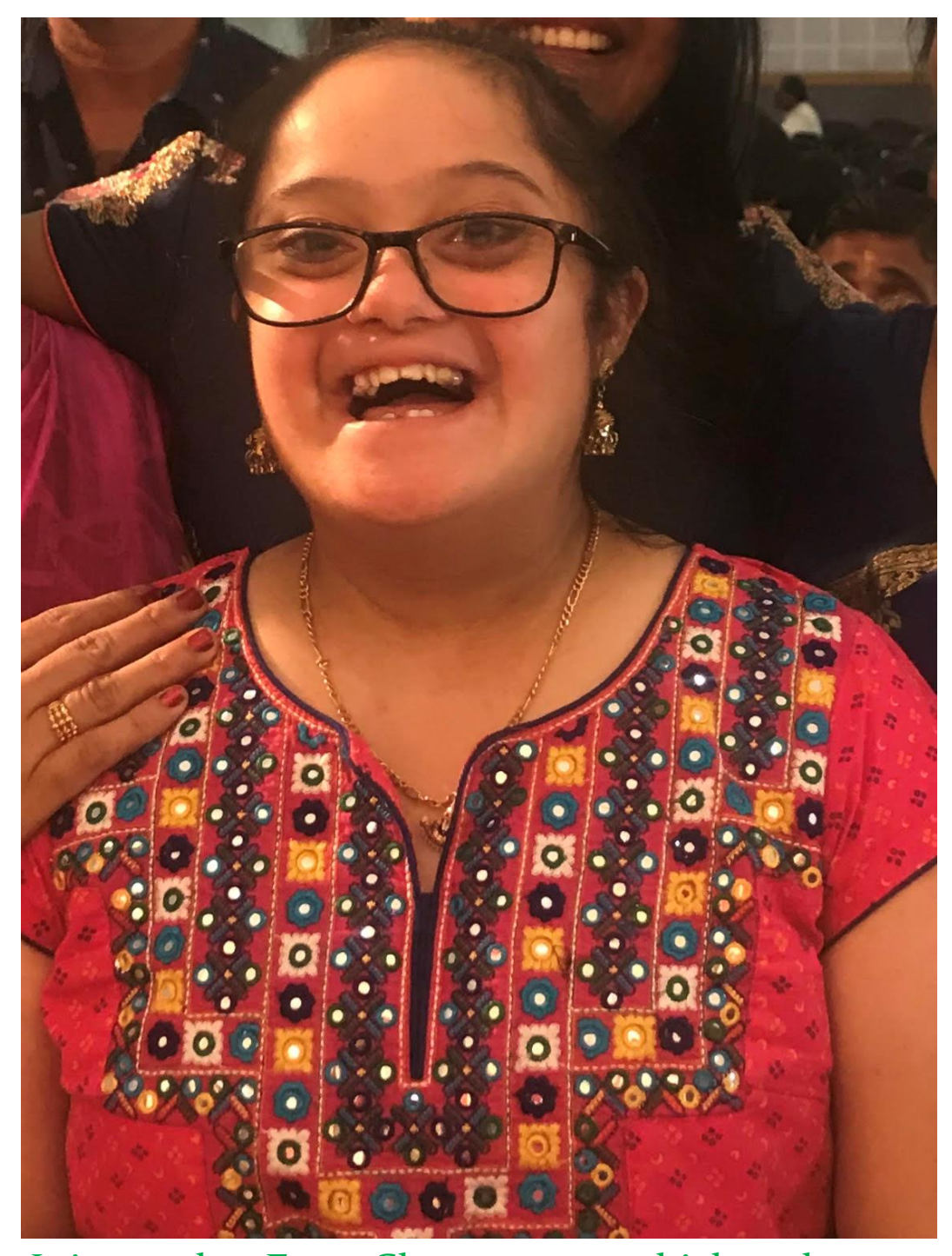
It is not that Extra Chromosome which makes me happy, it is because