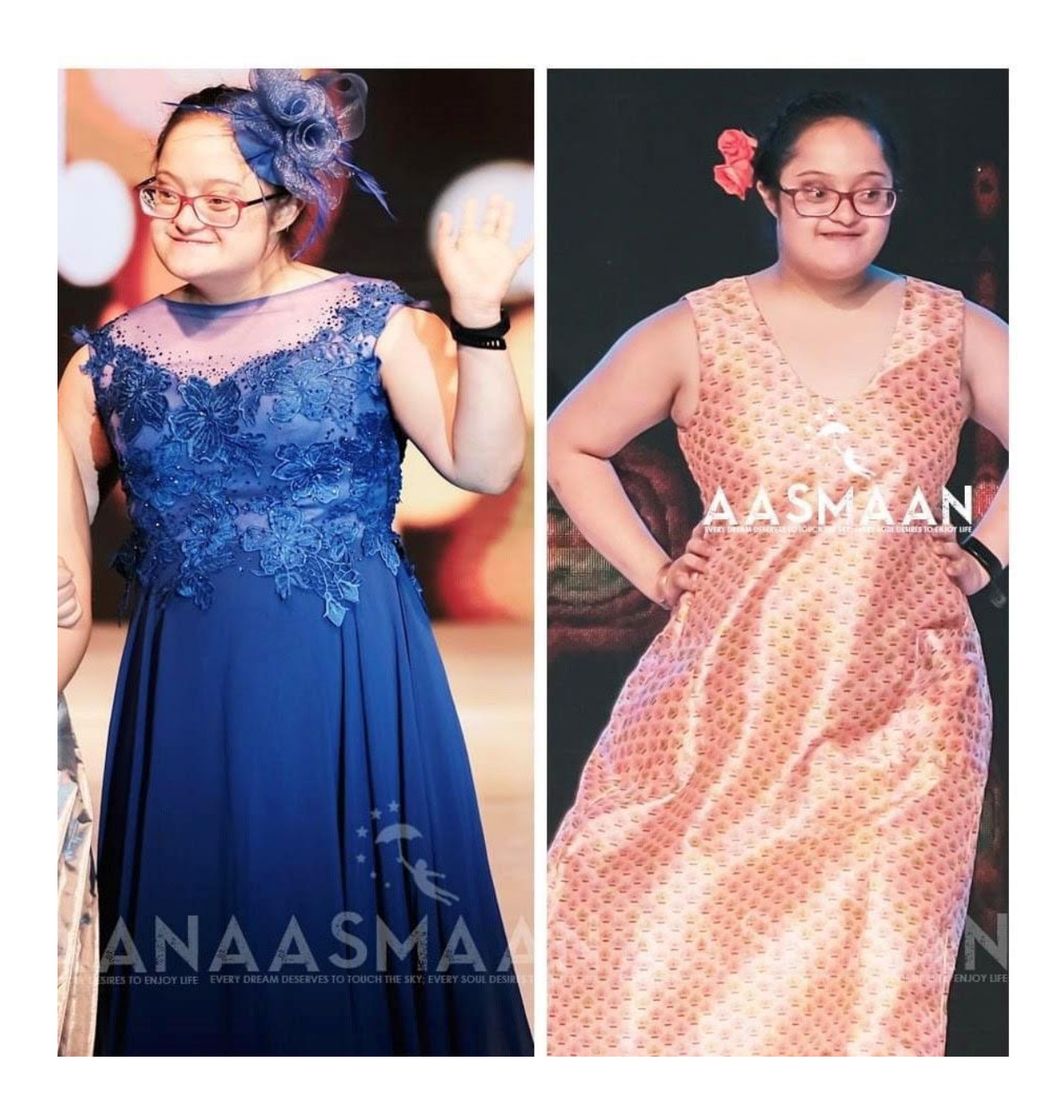
As a Model, I am elegant too?? I am a model in one of the first biggest fashion show for differently abled kids!!