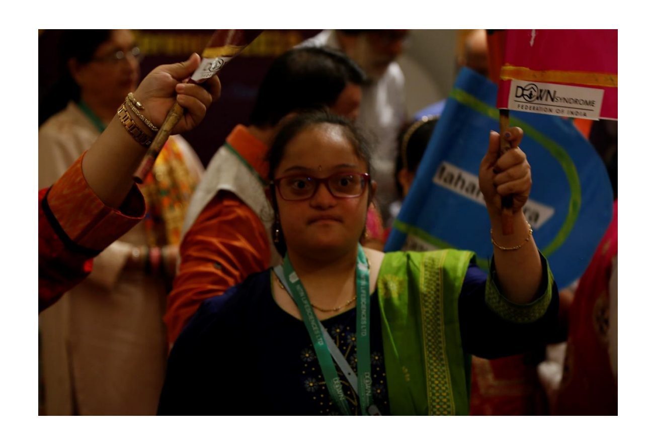
Ambassador in Down Syndrome Conference!!